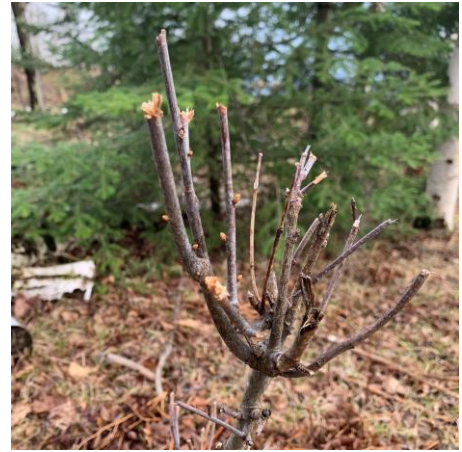
Heavy deer browse on young oak.

While maintaining a diversity of tree species is key to helping forests adapt to climate change, loss of species and declining diversity indicates a forest is vulnerable to climate change.