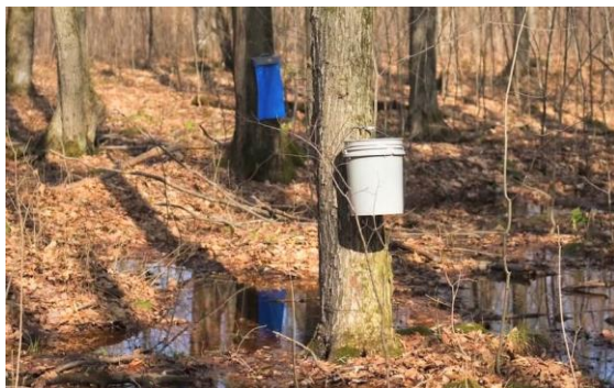
Variability and fluctuations in temperatures are affecting maple sugaring operations.

Sugar maple and yellow birch are known to be susceptible to frost root damage because of their shallow roots. Less snow and a shorter length of snow cover will reduce protection of those species from freezing temperatures.