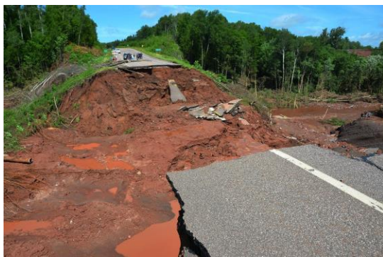
Road damage in northern Wisconsin from a 2016 extreme storm event.

All those factors combined are increasing the risk of summer droughts in future years.