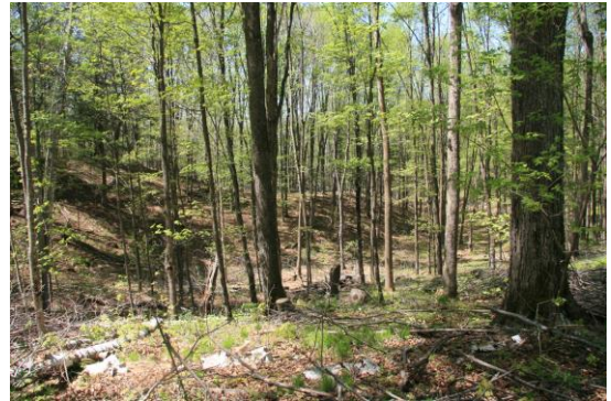
A Forest County privately-owned conservation easement with soils that can support old-growth forests.

NWLT will work with willing landowners to preserve private woodlands, especially those that adjoin already-protected forests, to help sustain this valuable resource and our northwoods communities.