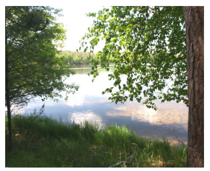
Proceeds from the sale of this 100-foot lot on Pickerel Lake will support NWLT's northwoods conservation efforts.

We have already received over $50,000 in pledges toward the costs of protecting public access to the waterfall and river. However, we still need one or more conservation buyers for the property who would be willing to purchase the land long enough for NWLT to acquire a perpetual conservation easement on it.