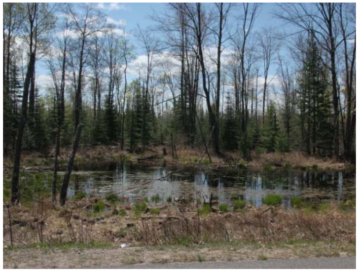
Ephemeral wetlands, or vernal ponds, like "Lake Donatu" on the Gager property may only hold water during the spring and early summer, but are important breeding areas for many frogs and salamanders.

Walt and Donna's three children and four grandchildren