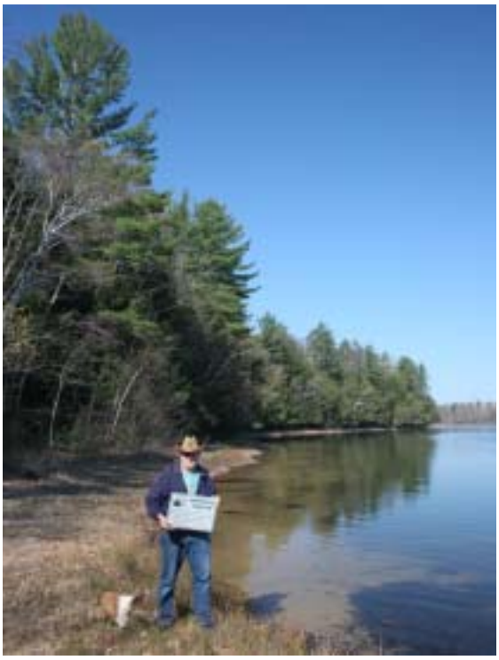
Over 3,800 feet of frontage on Squash Lake, a popular recreational lake west of Rhinelander, is now protected from development.

"Whoever takes over the land in the future cannot back out," Roger continued. "This is something forever, and I