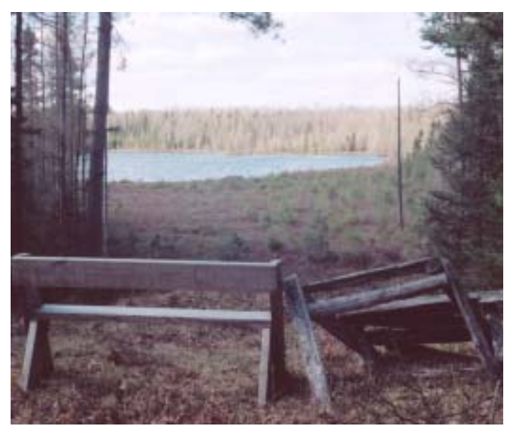
A guided walking tour of Tom Turriff's 140-acre conservation easement project in the town of St. Germain will be featured as part of the 2008 NWLT Annual Meeting. The tour is a unique opportunity for NWLT members and supporters to see this privately-protected property with its natural bog habitat fringing the shoreline on Mud Lake.

DIRECTIONS: The Pavilion is located just one-half block west of the intersection of Hwy. 70 and Hwy. 155 in downtown St. Germain on the north side of Hwy. 70.