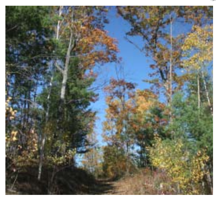
These 75 acres of productive woodlands will never be subdivided for new residences thanks to the Nagy family conservation easement.

With their perpetual conservation easement, the Nagy family has made a lasting commitment to ensure at least some of those natural spaces are now protected.