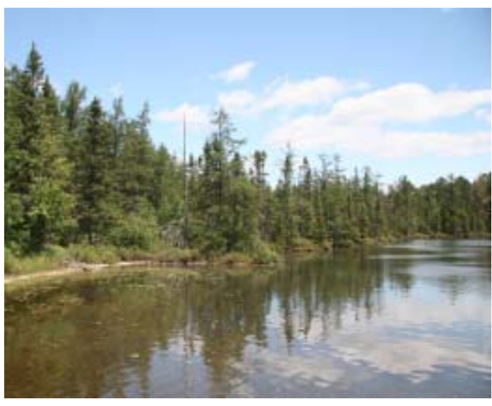
The 18.7-acre Katisch property is contiguous on three sides with Vilas County Forest lands, including this north shoreline of Range Line Lake.

lake," said Pierce. "On the south side there is also a real nice natural buffer strip of shoreline habitat between the Katisch home and the adjacent lakefront property. Within the conservation easement, those two areas are designated as shoreland protection zones."