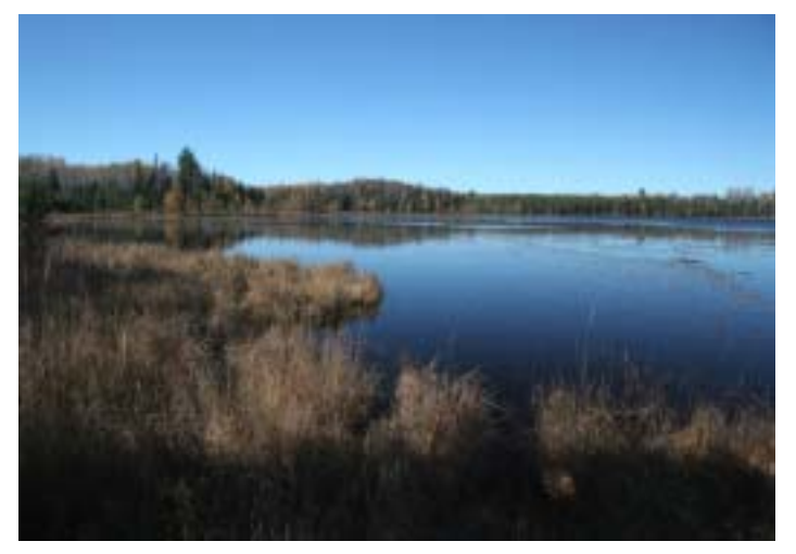
Walter and Janet Wellenstein permanently protected 595 acres surrounding McCabe Lake, a "wild lake" in Oneida County.

"We've worked with private landowners to voluntarily conserve natural shorelands on 28 different lakes and eight rivers and streams," Pierce said. "These projects have included protection of all or parts of sixteen, mostly undeveloped wild lakes. These small wild lakes have seen increasing development pressures recently as fewer and fewer lots are available on the larger, more developed lakes."