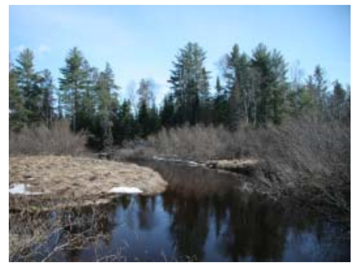
This stretch of the upper Wisconsin River in Vilas County was protected with a perpetual conservation easement in 2007 by June Wedell, with funding assistance from the John C. Bock Foundation.

The ALFW grant covered the costs of having naturalist John Bates conduct an ecological assessment on a 133acre woodland property in Oneida County. The assessment is part of the baseline documentation needed for a perpetual conservation easement still in progress. The woodland property includes some true, old-growth forest habitat with giant eastern hemlock, sugar maple, basswood, yellow birch and white pines. The property is also adjacent to Nicolet National Forest lands, so it has significant conservation values. Thanks again to ALFW!