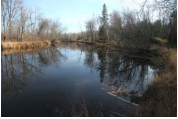
Over 300 acres and 1.4 miles of shoreline frontage along the Pelican River in Oneida County were conserved by Roland and Ruth Rueckert.

"In 2007 we added nine additional conservation easements granted to the land trust," Pierce said. "These projects are located in Vilas and Oneida counties and spread out in nine different towns. We also serve as a backup-holder and provided technical assistance for an additional land protection project granted to the Last Wilderness Conservation Association in Presque Isle."