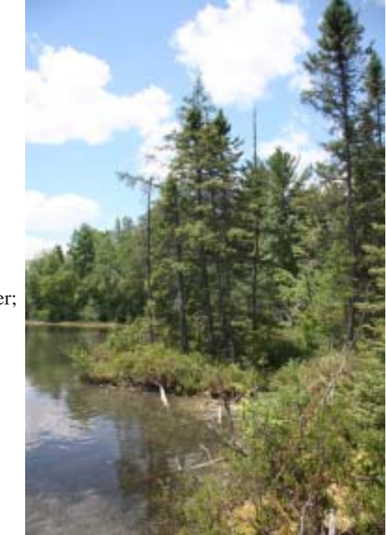
As a buffer for adjacent Vilas County Forest lands, only limited development will be allowed on the 18.7-acre Katisch property on Range Line Lake.

"We want to express our sincerest thanks to each of these landowners for their outstanding commitment to conservation," said Pierce. "They have left an incredible, lasting legacy of wild lands and pristine waters for future generations."