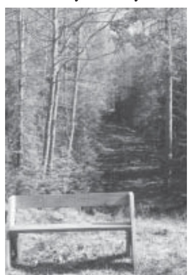
Conservation buyers may be the last best hope for preserving wild tracts in the northwoods.

The Northwoods Land Trust recently started an effort to link potential conservation buyers with landowners who want to ensure their property will be protected. NWLT will maintain a list of potential conservation buyers and will notify them when land becomes available. NWLT will also maintain a list of landowners who would prefer to sell their property to a conservation-minded buyer. The lists are strictly voluntary and strictly confidential. We will immediately remove your name at any time upon request.