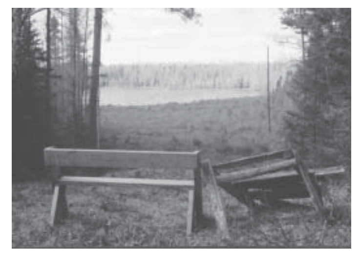
Nearly 500 feet of frontage on Mud Lake, a DNR-listed "wild lake," was permanently protected with the Turriff conservation easement.