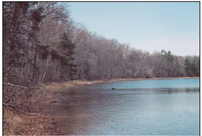
Over a half mile of natural shoreline frontage on Jerm's Lake, a 72-acre seepage lake, is now protected by the Greenwald family conservation easement.