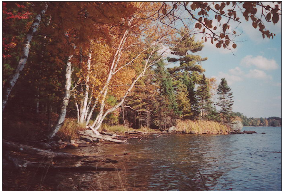
Willa Schmidt's conservation easement permanently conserves over 1500 feet of natural shoreline on Snipe Lake.

The Schmidt property is a great example of working cooperatively with the local Snipe Lake Association to provide lasting protection to a significant stretch of natural shoreline. The Snipe Lake Association partnered with Schmidt and NWLT by contributing funds to help cover the costs of the granting the easement.