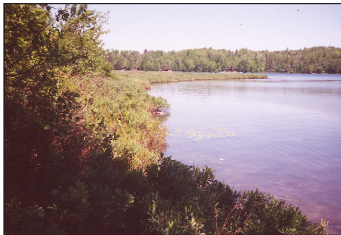
The Powell family granted a conservation easement permanently protecting 16 acres and over 1000 feet of frontage on Heart Lake, including this unique wetland point.

While there are some financial incentives for landowners interested in conserving their properties, the bottom line is: they love their land. Willa's interest in protecting her property developed long before the Northwoods Land Trust was established. She researched conservation easements, encouraged the forming of NWLT, and has been actively supporting the organization from the start.