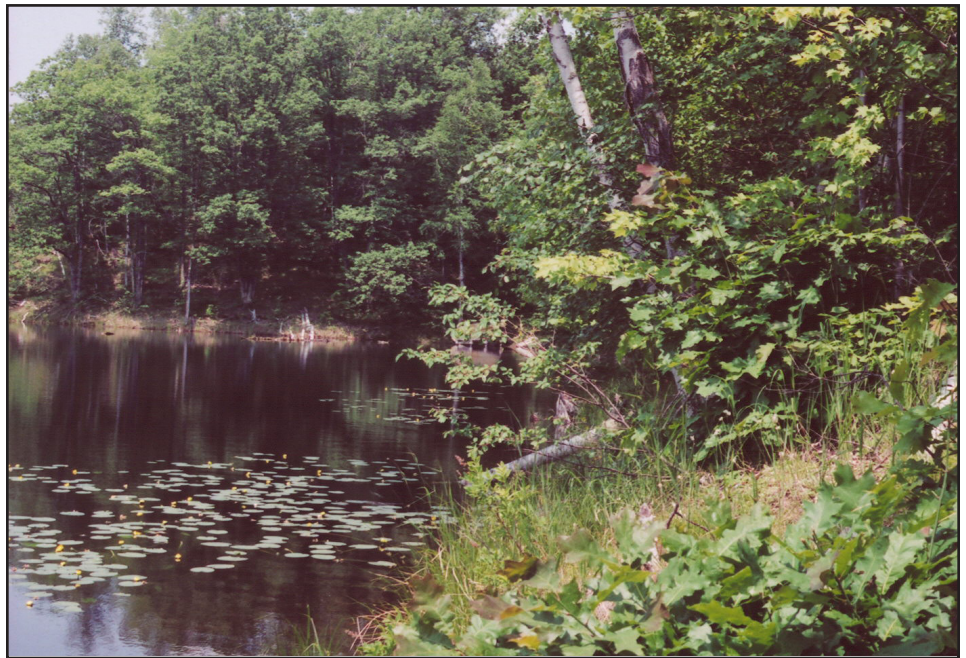
Nearly 200 feet of natural shoreline frontage on Bog Lake, a 10-acre wild lake, is now protected by the Perry family conservation easement.