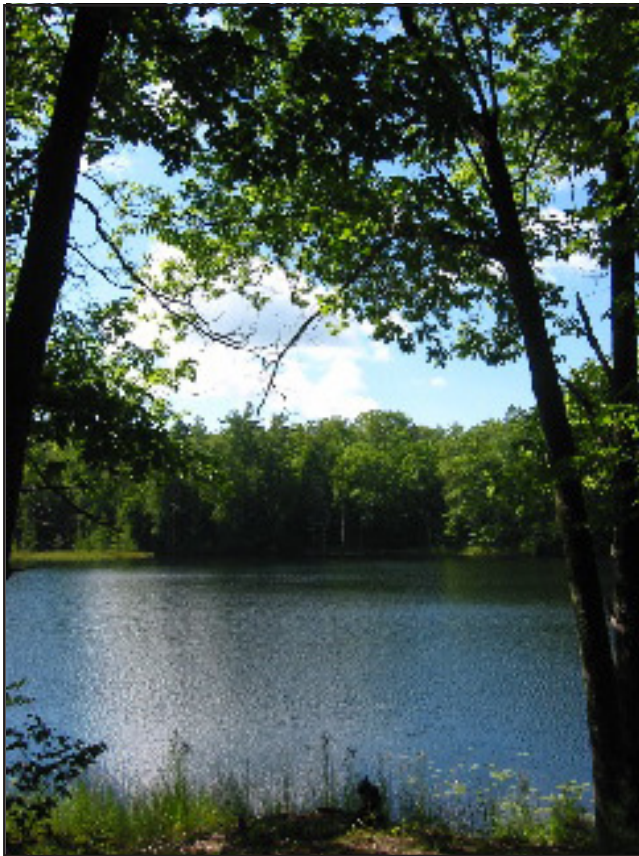
The last remaining undeveloped private shoreline on Bog Lake is now protected with the Perry easement.