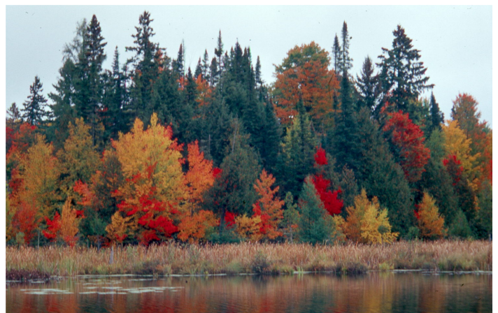
The Northwoods Land Trust's first Conservation Area Registry Program property looks to protect a beautiful section of stream in the Land O' Lakes area.