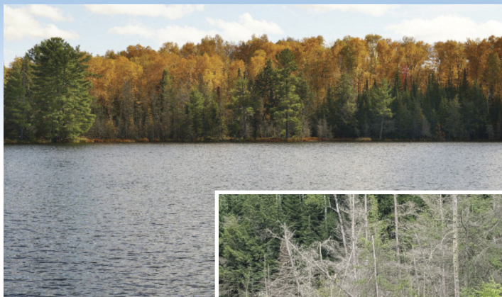
ABOVE: Protected shoreline on Kabol Lake in Price County.