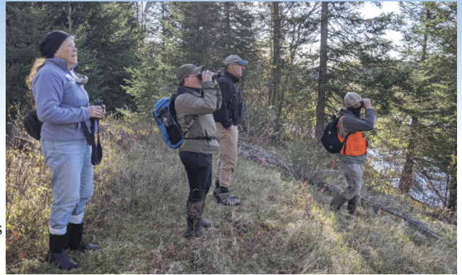
Birding in early spring 2021 at the Beaver Creek Hemlocks.