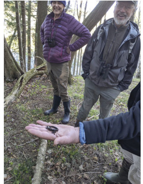
Signs of life in very early spring lift the spirits of visitors to NWLT conservation land.