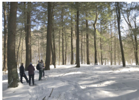
Winter solace at the Beaver Creek Hemlocks in Iron County.