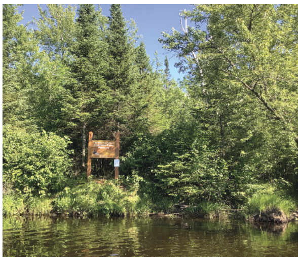
The Walter "Len" Hilgart Flambeau River Preserve, donated in December of 2020.