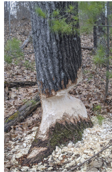
Front cover: Summer bounty at the Beaver Creek Hemlocks property.