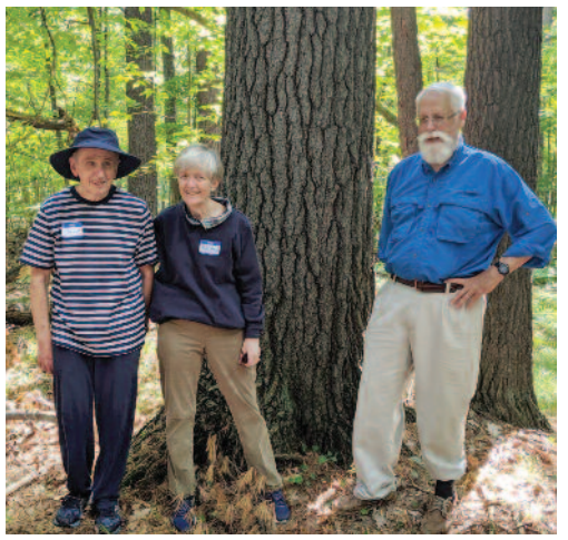
ABOVE PHOTOGRAPHS: NWLT staff and volunteers install welcome signs at the Yawkey Forest Reserve.

BELOW (left to right): Members of the Yawkey family enjoy a hike with NWLT after the dedication. Members of the Glashagel family at the new Carlin Lake Nature Preserve sign.