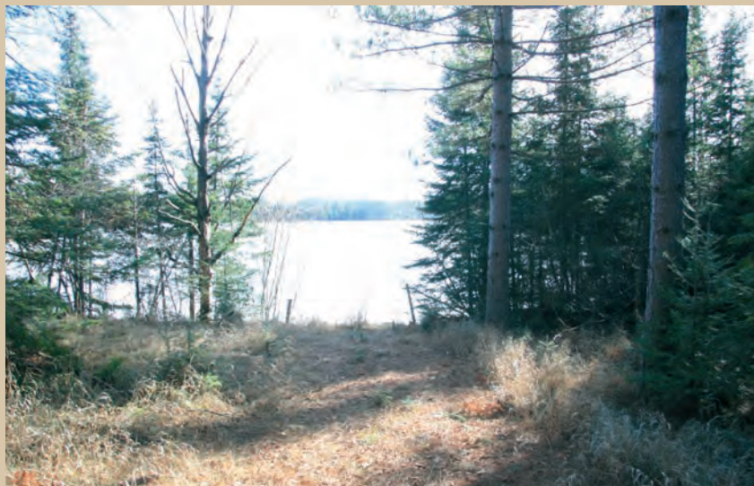
The new Van Vliet Lake Conservation Area includes about 2.4 acres and 377 feet of natural frontage on Van Vliet Lake.

Directions: The Presque Isle Community Center is located about two blocks northeast of the intersection of County Highways B and W in downtown Presque Isle, next to the library. To get to the Van Vliet Lake Conservation Area, go 1/4 mile east on Cty. B, turn south and follow Crab Lake Road south and west about 4.5 miles. Turn north on West Van Vliet Road and follow it about 1.5 miles to Fire # 7266.