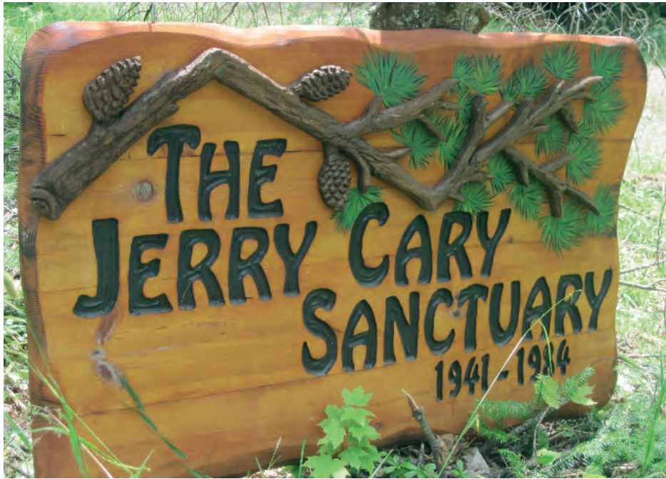
NWLT's latest conservation land donation project features the Jerry Cary Sanctuary on Van Vliet Lake in Vilas County.