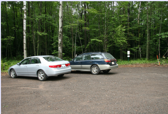
The Interstate Falls parking lot is accessed off of West Center Drive just west of the intersection of U.S. Hwy. 2 & U.S. Hwy 51.