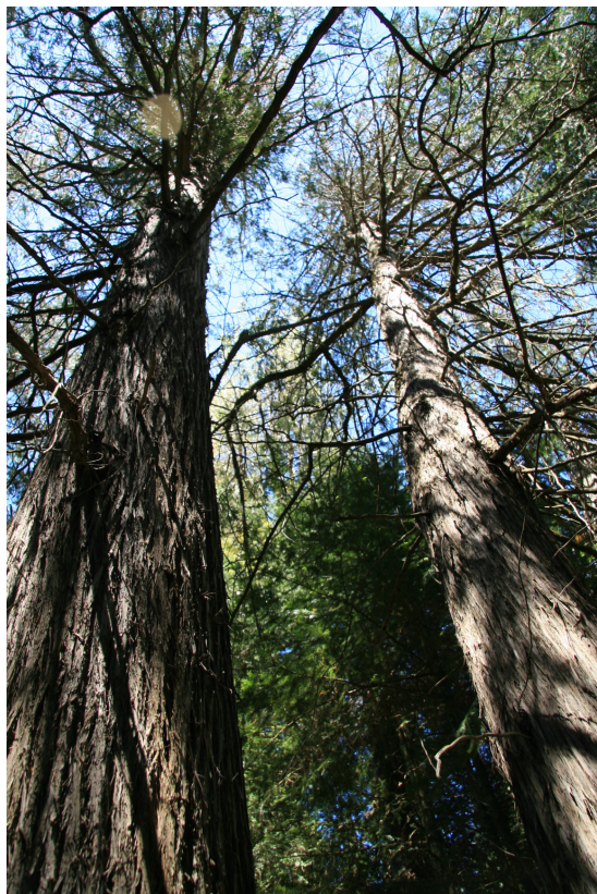
Old-growth white cedars make up a rare forest habitat type in Wisconsin.

However, a stand of old-growth white cedar trees still exists on the property. Old-growth white cedar is a relatively rare forest habitat type in Wisconsin, and also often hosts rare orchid species. It is also an important winter deer yard.