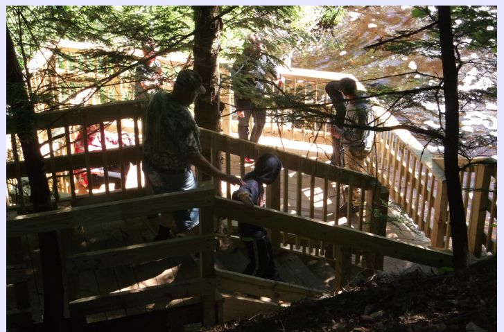
The stairway with viewing platform is already a popular attraction below the falls!