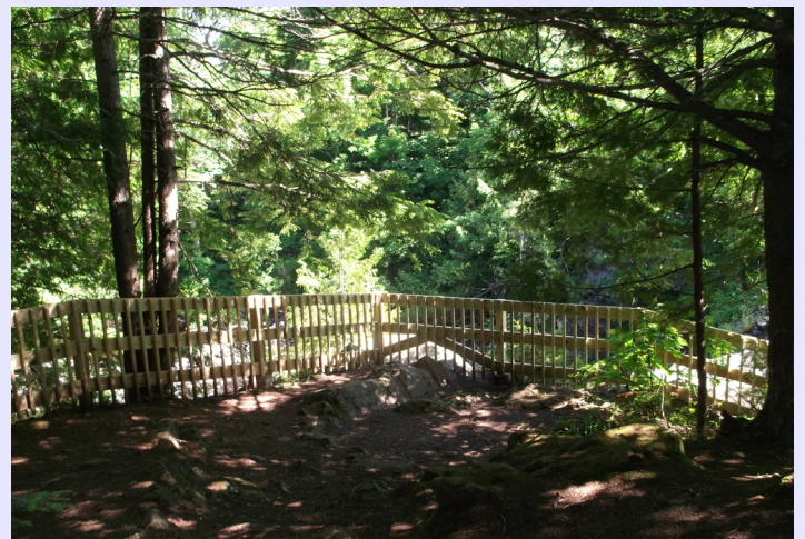
With supports anchored into the rock at the lip of Interstate Falls, the new railings will help kids and pets (and adults) stay safe.