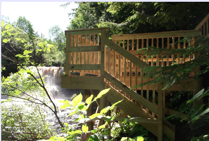
The new viewing platform also includes stairs for those who want to scramble down to the river to fish.