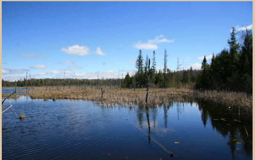
The new Marshall Wildlife Conservation Area includes about 96 acres and 1.3 miles of creek and beaver pond habitat.

Directions: The Lac du Flambeau Tribal Natural Resources Center is located about one mile west of downtown Lac du Flambeau on Hwy. 47. To get to the Marshall Wildlife Conservation Area, go south of downtown Lac du Flambeau on County Hwy. D for 4 miles, turn west on Hwy. 70 about 3 miles and turn south on East Squaw Lake Road. Turn west on North Squaw Lake Road about 250 feet to the trailhead.