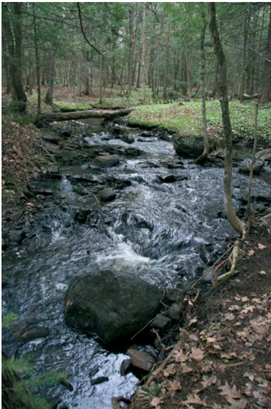
About 1/4 mile of Cominski Creek, a Class I brook trout stream, also flows through the Interstate Falls property.