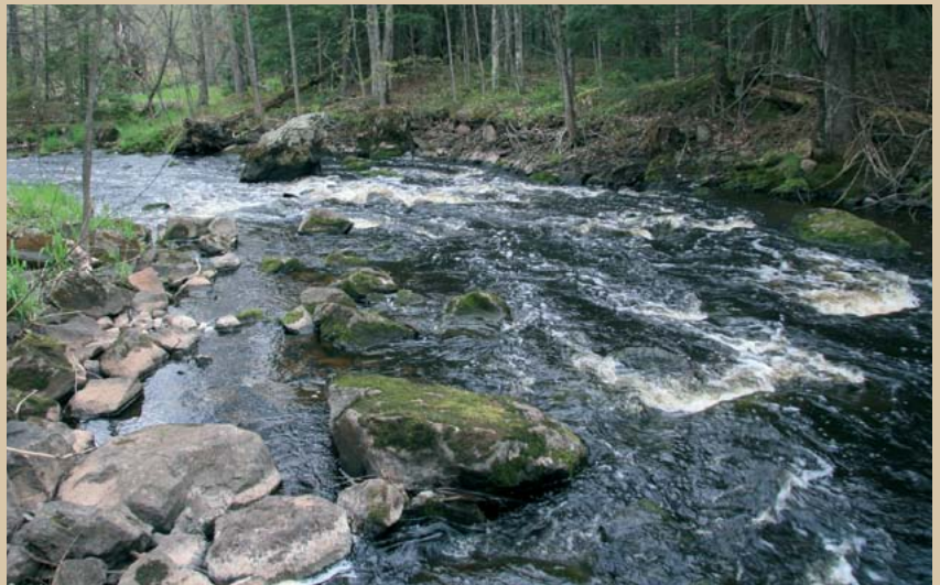
The Interstate Falls site includes about 2,500 feet of shoreline on the Montreal River.

Directions: The Town of Kimball Community Center is located just one-half mile west of the intersection of U.S. Hwy. 51 and U.S. Hwy. 2 in Iron County, WI. From the intersection, go west on Hwy. 2 and turn left on Center Drive (1st road crossing west of the major intersection across from Stoffel's Country Store) for 1/2 mile. If you miss that road, go 1/2 mile west on Hwy. 2 and turn south for 1/4 mile on County Hwy. D.