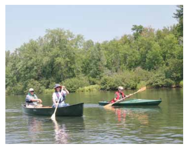
Join us for a fall colors canoe/kayak trip on the Upper Wisconsin River on Saturday, October 6th with the River Alliance of Wisconsin.

When: Saturday, October 6, 10 a.m. - 3 p.m. Cost: $25 - a fundraiser for the River Alliance. Details: Bring your own boat, paddles & life preserver.