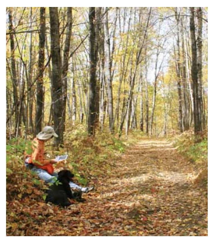
The protected land includes 82 acres of forest and wetland habitats which serve as natural buffers adjacent to the Oneida County Forest.

"I cut an article out of the newspaper (about the Northwoods Land Trust) a couple of years ago," continued Carol. "I kept it next to my computer for almost a year before I actually looked it up on the website. I ended up talking to Pat Dugan (who donated conservation land on Squash Lake to NWLT)."