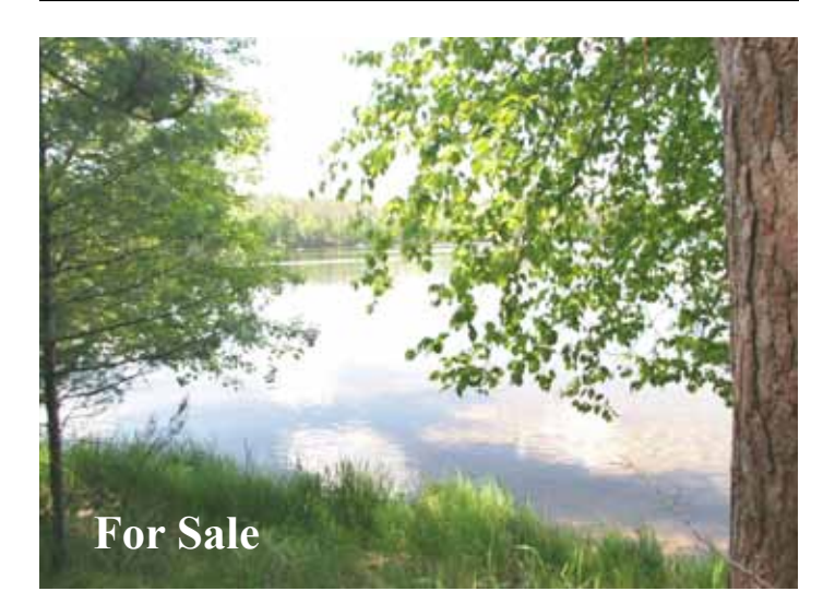
Proceeds from the sale of this donated 100-foot lot on Pickerel Lake west of Eagle River will also support NWLT's conservation efforts. See the NWLT website for details: www.northwoodslandtrust.org.

Other contributions are always welcome and will help the land trust preserve another special place in the northwoods!