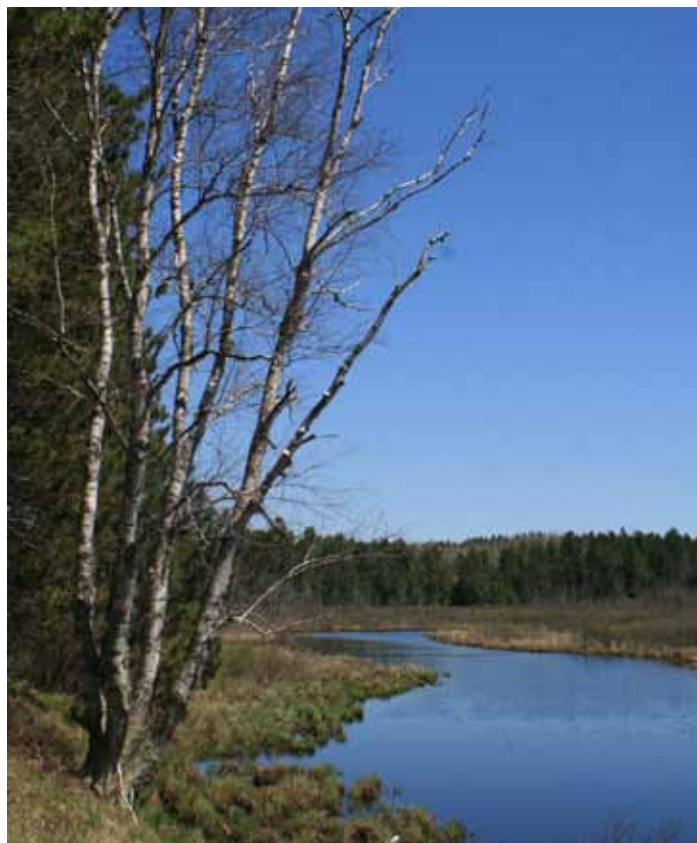
The protected land provides natural habitat buffers around and adjacent to the Squirrel River Pines State Natural Area.

Note: TNC is an important conservation partner for NWLT. Dallman provided assistance during both the purchase and conservation easement phases of the protection effort.