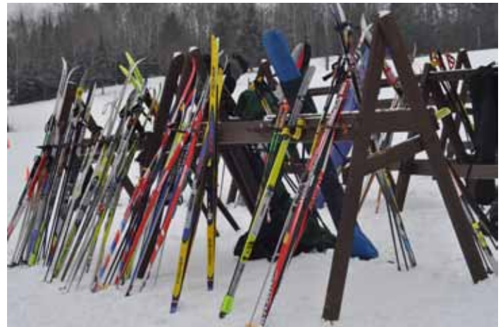
Minocqua Winter Park is considered one of the premier cross-country ski trail systems in the Midwest, with over 70 kilometers of well-groomed ski trails.