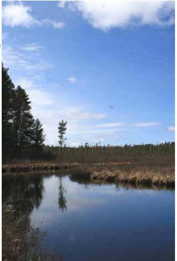
Over 13 miles of river, stream, lake and pond shorelines were protected by the Winter Park conservation easement, including the Squirrel River (above).

Left: “I climbed the tower all the time, and my kids have climbed it. It is the best view in the whole county... After a while you get to really appreciate the beauty with the big trees.” - Ken Aldridge