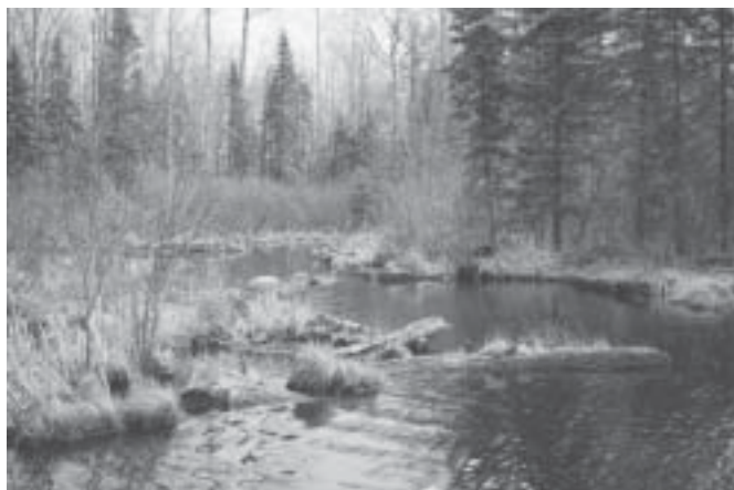
Over one mile of Springstead Creek and Lower Springstead Lake shorelines in Iron County were protected with a conservation easement by Meta Reigel.